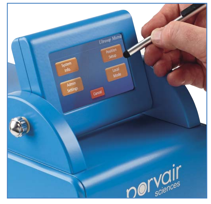
▲ All parameters can be programmed through the large colour touch screen display, using the stylus provided.

sides, steel cover plates powder-coated for solvent resistance and wide large rubber feet for bench top mounting. The Levante has a built-in fume duct and an optional fan unit is available to speed solvent vapour removal away from the plate, thus increasing the evaporation rate further. New auto-ranging 110/220V power supplies eliminate the need for a transformer and provide sufficient power to drive the heaters and motor without drawing an excessive load, thereby extending the life of your instrument.